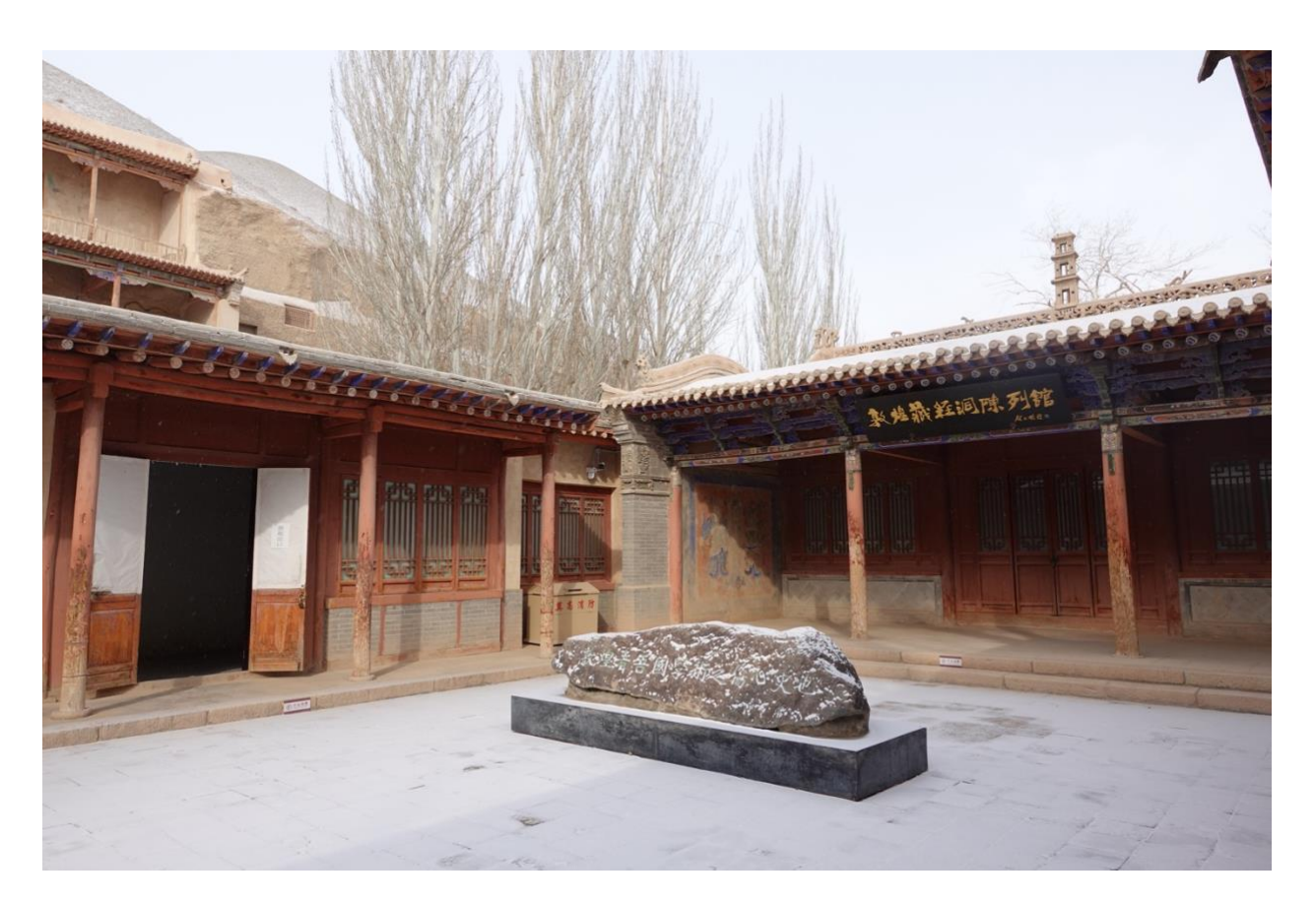
This Library Cave Exhibition, located directly across from the Nine Story Pagoda, depicts the imperialistic tragedy that occurred here in the early 20<sup>th</sup> century.

For now, the IDP is the best — and perhaps only — solution.