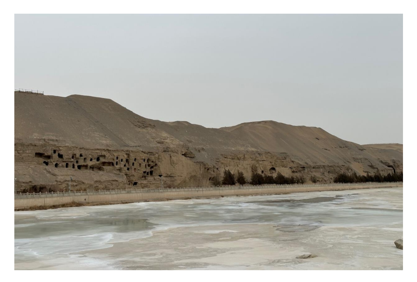
The first grottoes that we see on our bus ride.

Only after these two films are completed are we deemed sufficiently primed to be taken to the caves on DA-sanctioned buses. At long last, two hours after arriving, the first grottoes finally begin to appear.