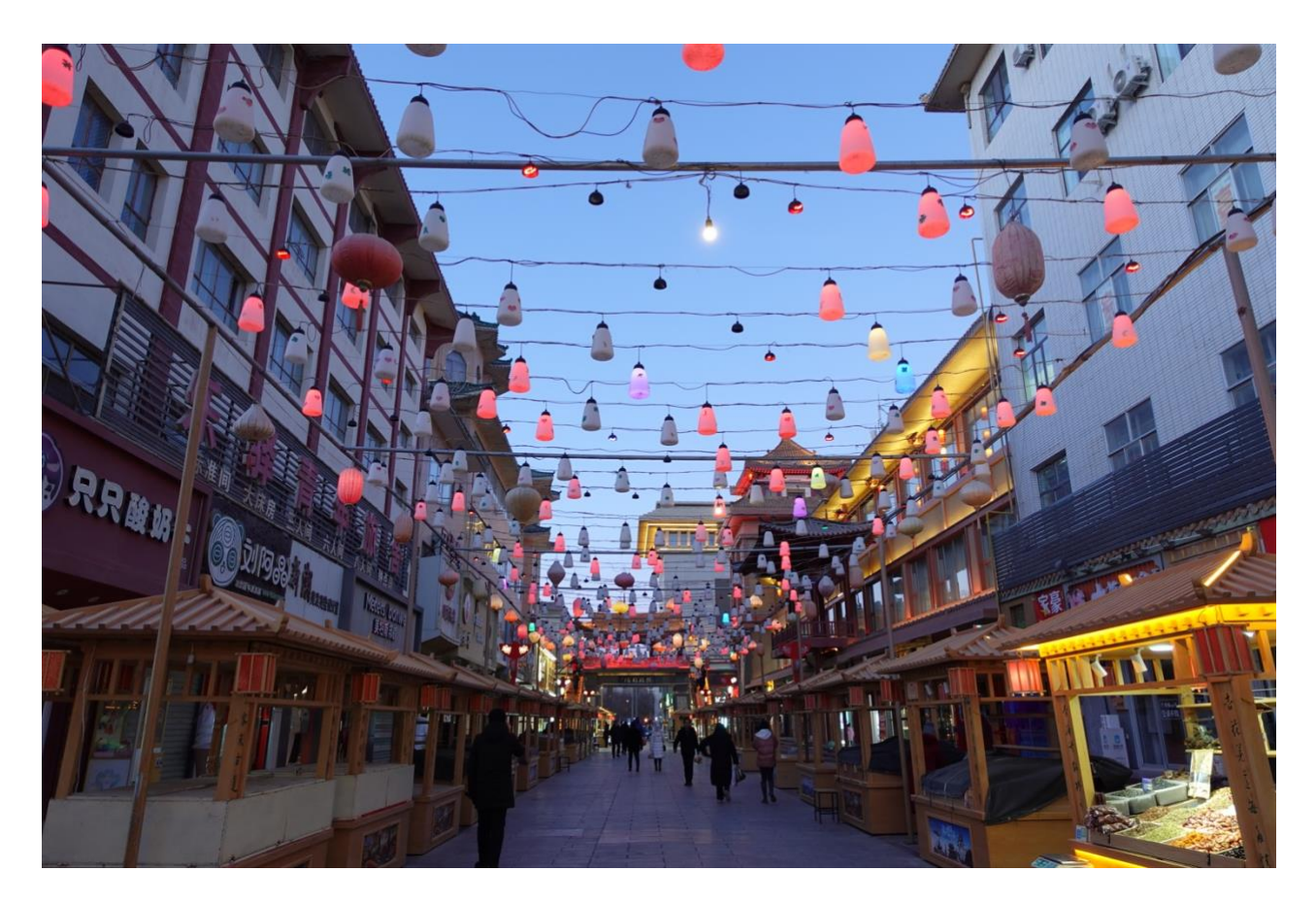
The Dunhuang Nightmarket is largely empty in the off-season.

Outside downtown, the difference is even more pronounced. The Silk Road Dunhuang Hotel, a behemoth of a building, stands in a brutal show of dominance in front of a landscape of small family farms and faded, two-story concrete homes. Just a few minutes down the road there's a farmer herding a flock of goats through a thicket of dry grass, a stand selling a freshly skinned pig, and old pickup trucks rumbling by.