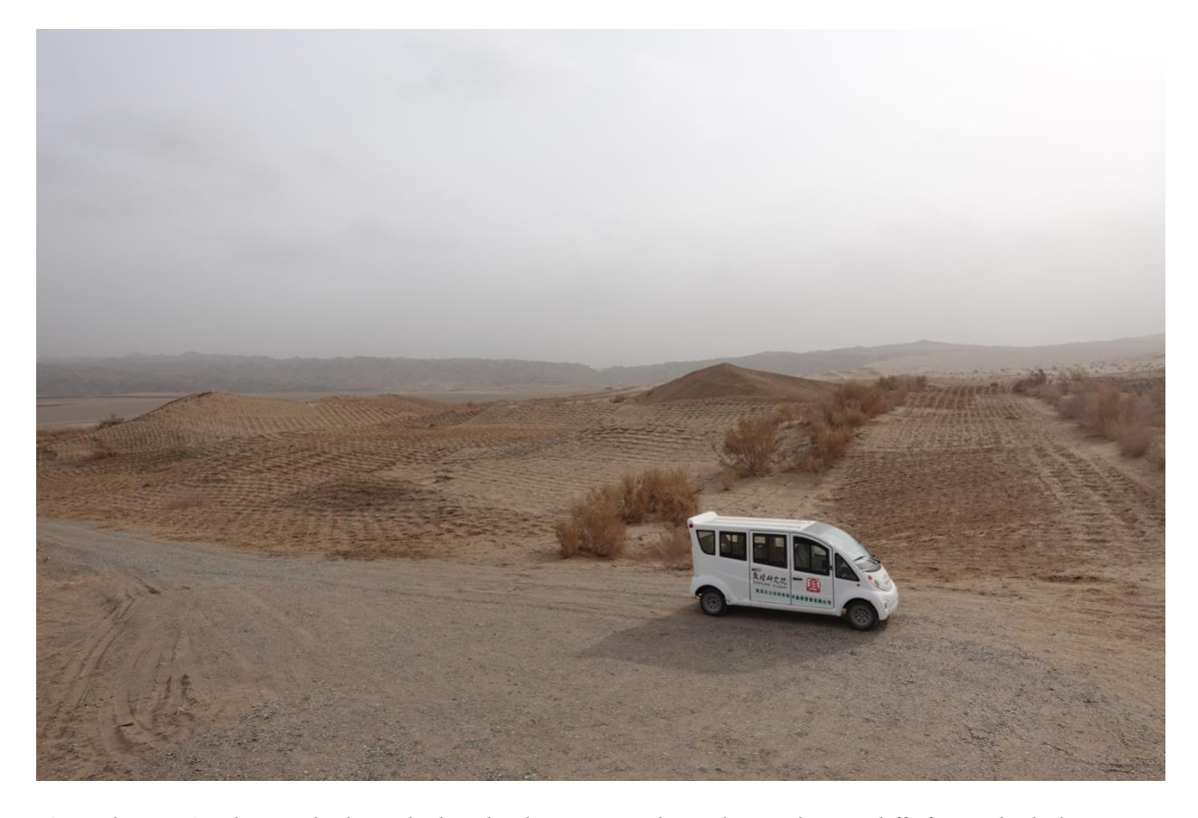
A Dunhuang Academy vehicle parked in the desert area above the sandstone cliffs from which the Mogao Grottoes are carved. Wind carried thousands of tons of sand into the caves in their years of neglect.

But the physical demand of keeping the grottoes physically safe was unending. Constant sand intrusion meant sweeping was never done. And the occasional flood could be disastrous. When snow melted from the neighboring Qinling Mountains, the neighboring Daquan River's normal salty trickle could transform into a raging flood.