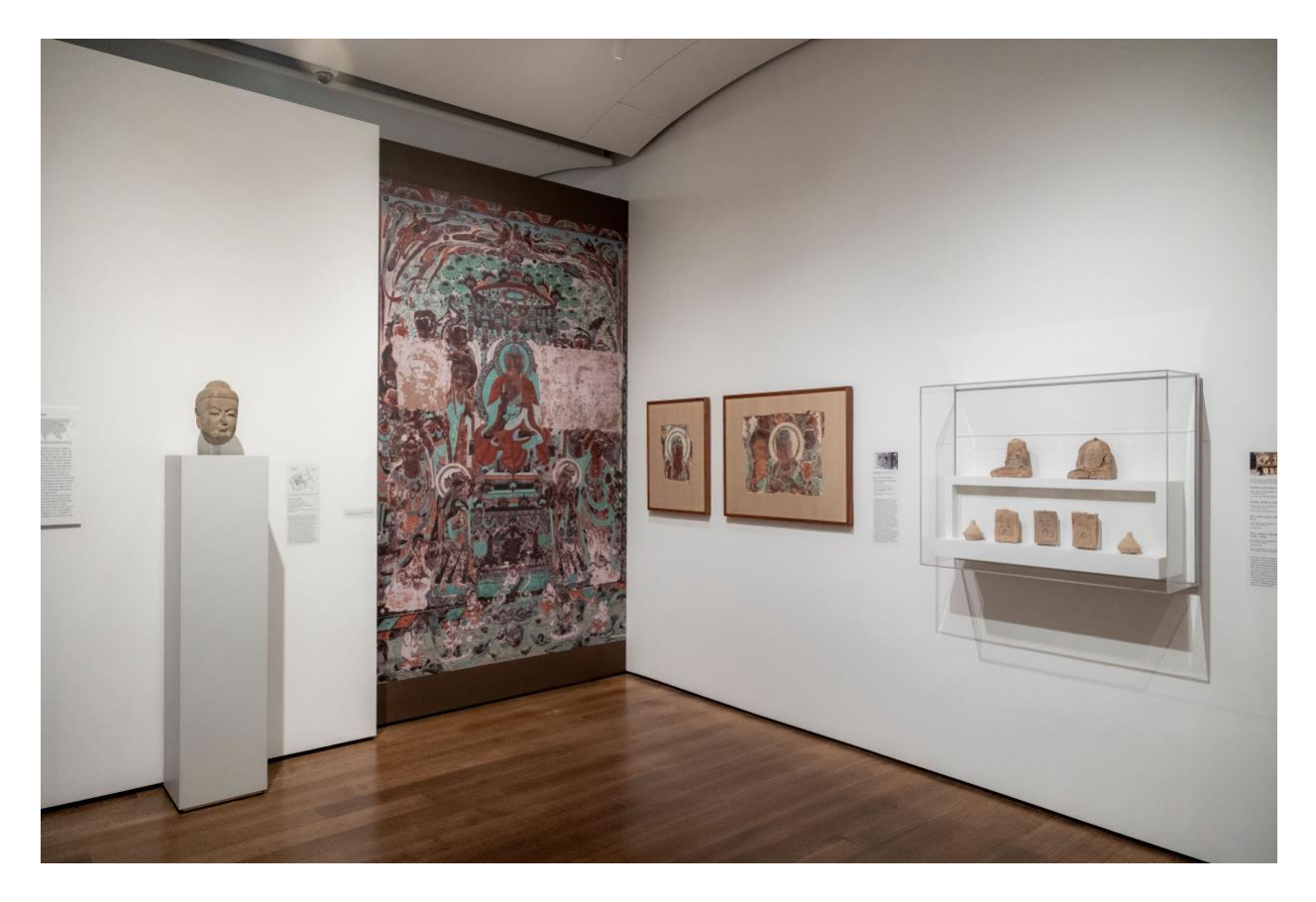
Artifacts from Cave 320 during the exhibit Objects of Addiction: Opium, Empire and the Chinese Art Trade, on display September 15, 2023–January 14, 2024 at the Harvard Art Museums, Cambridge, MA.

Now, the conservation team is also working on digitizing the full collection. Recently, the bodhisattva was removed from its case for high-resolution photogrammetry for the first time. The Harvard Art Museums has also signed an agreement with IDP to include Harvard's collection within the database. Before it could be uploaded, however, catastrophe struck.