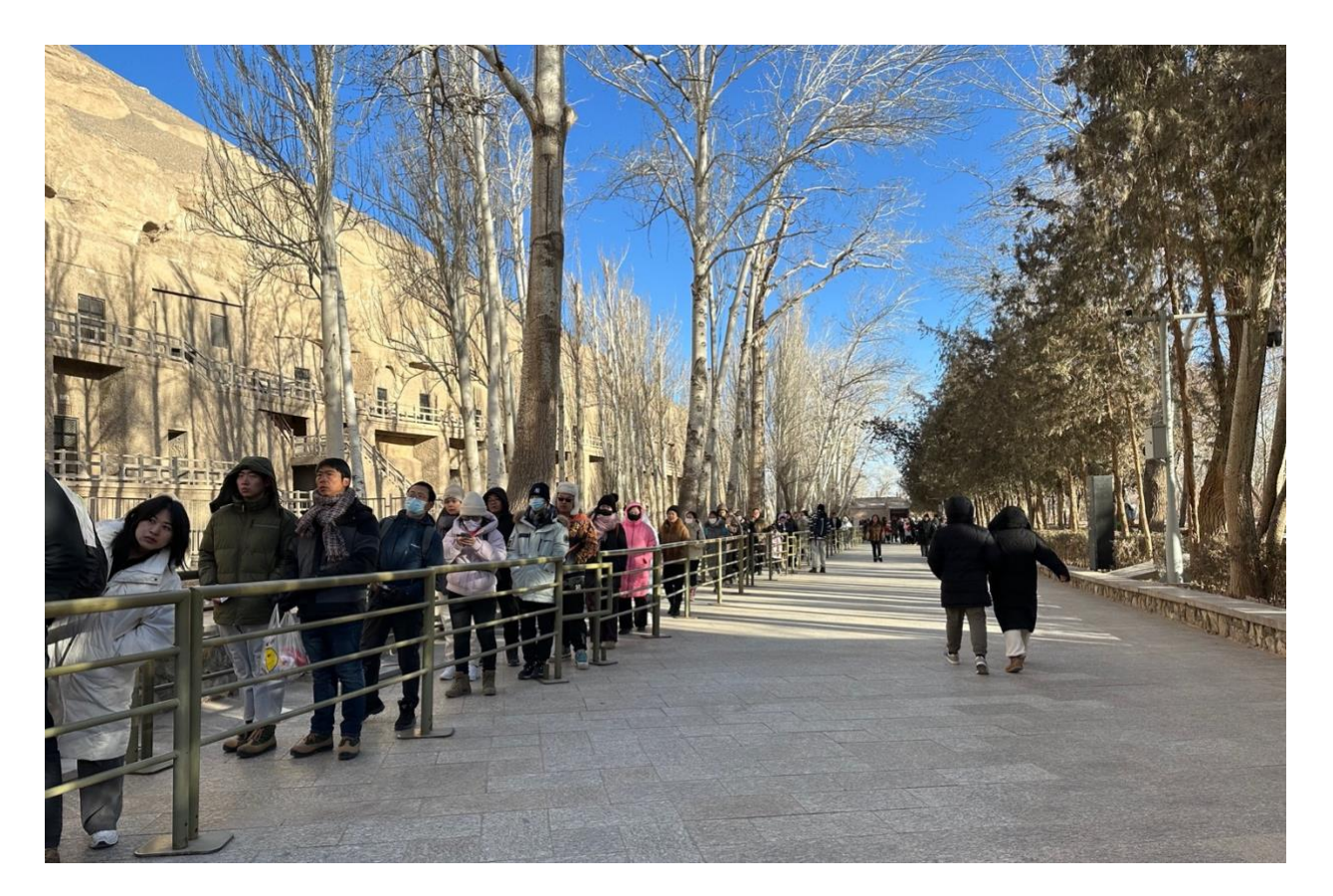
Tourists line up at the entrance to the caves.

that in the summer months of July and August, 18,000 visitors will descend upon the site every day: a combination of 6,000 normal tickets and 12,000 emergency tickets.