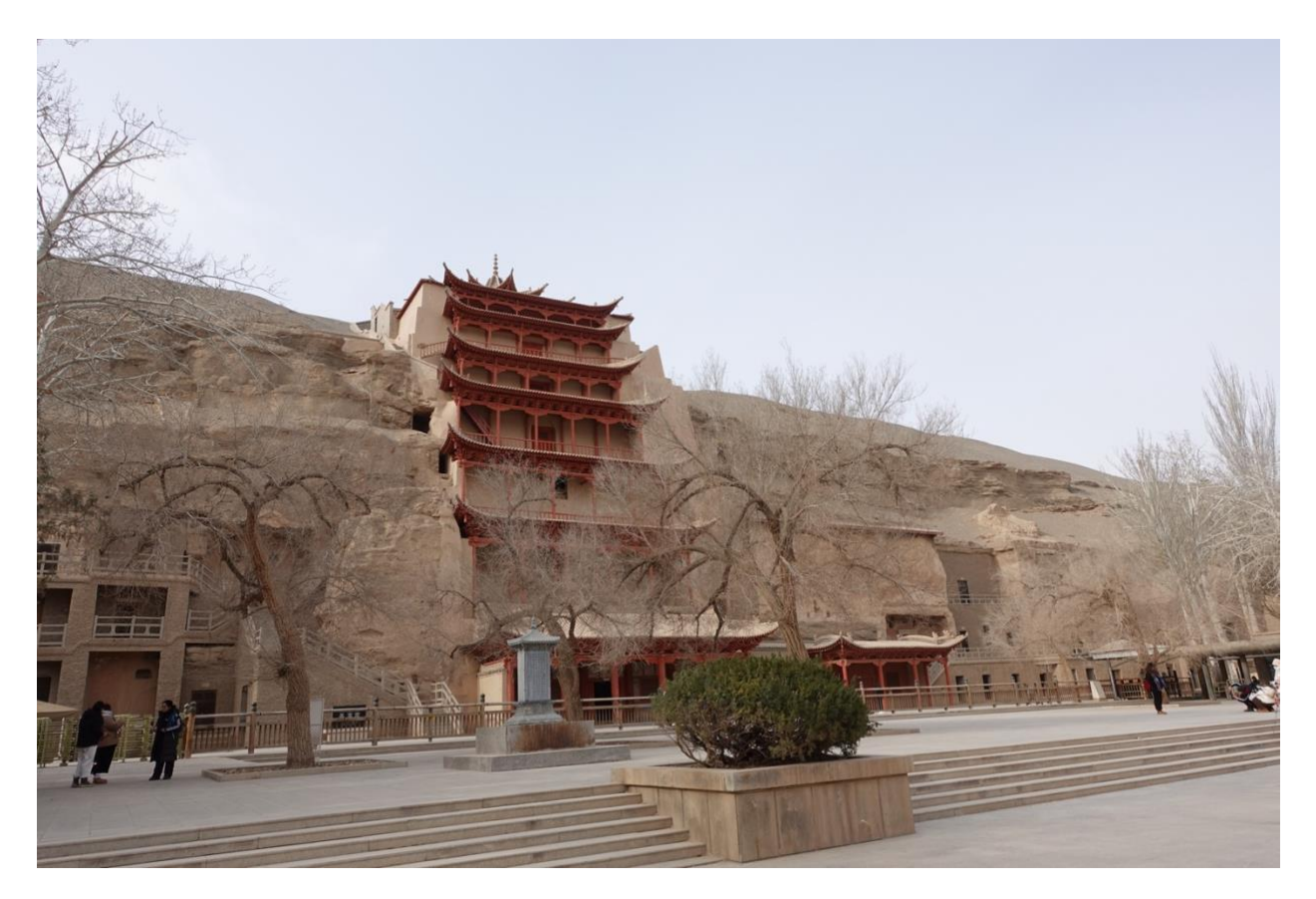
The famous nine-story pagoda of the Mogao Grottoes, an archaeological site of world significance located outside Dunhuang, China.

At 8 am on a Tuesday, I'm standing in a desert, in the middle-back section of a line of at least two hundred tourists, getting pelted by snowflakes. They're falling hard and fast, a rare January snowstorm for this typically dry climate. But what awaits us is worth the minus 15-degree Celsius chill. In just a few hours, we'll be able to see the greatest treasure trove of Buddhist art in the world: the Mogao Grottoes.