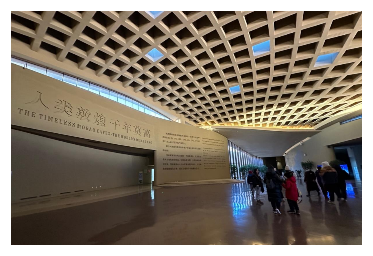
The lobby of the $50 million Digital Visitor Center.

And by 9:30 am, the theater for the first movie is already at full capacity. I'm sitting elbow-toelbow with my neighbors as the lights are dimmed. As the movie begins telling the story of how the caves came to be, the audience and I are transported back to the past.