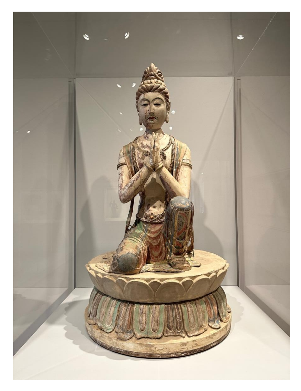
The Kneeling Attendant Bodhisattva from Cave 328, today displayed at the Harvard Art Museums.